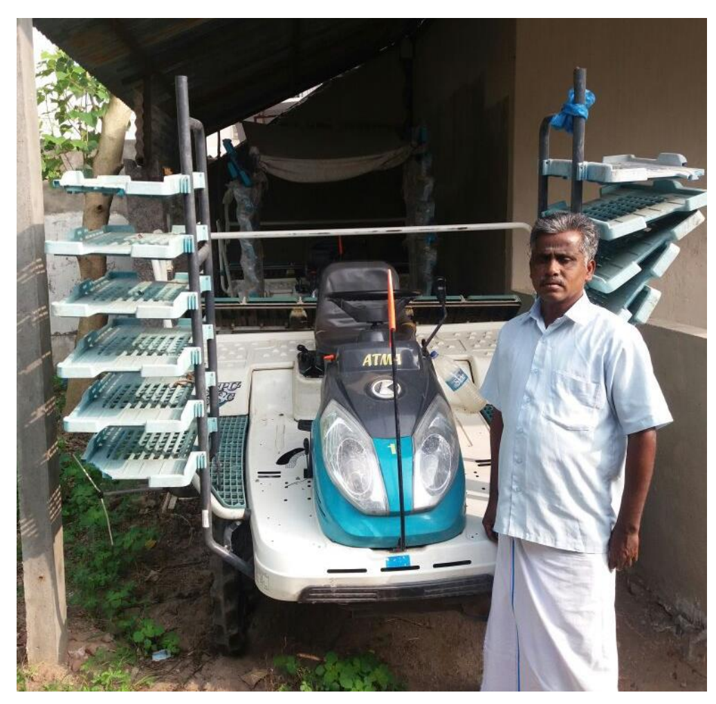
PRESIDENT OF THE CIG WITH PADDY TRANSPLANTER PURCHASED UNDER RKVY PROJECT