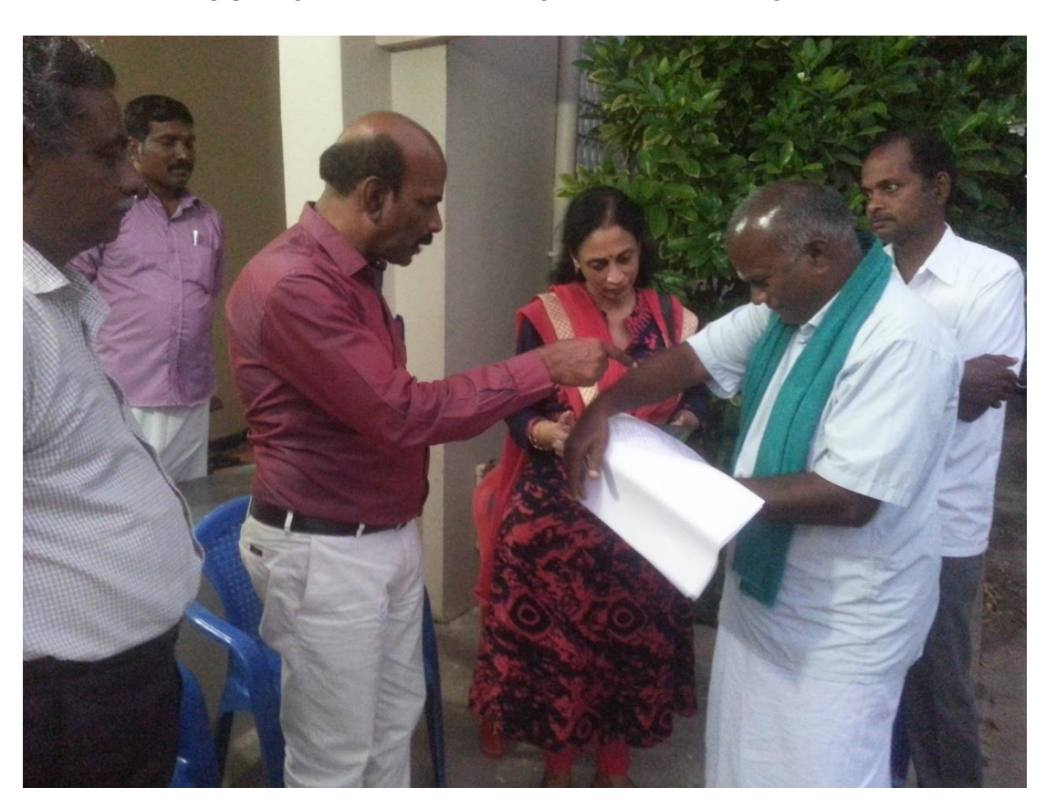
PROJECT DIRECTOR (ATMA) AND CIG PRESIDENT INTERACT WITH THE JOINT SECRETARY (RKVY), GOVT. OF INDIA, N. DELHI ABOUT THE FUNCTIONING OF CUSTOM HIRING CENTRE RUN BY THE CIG