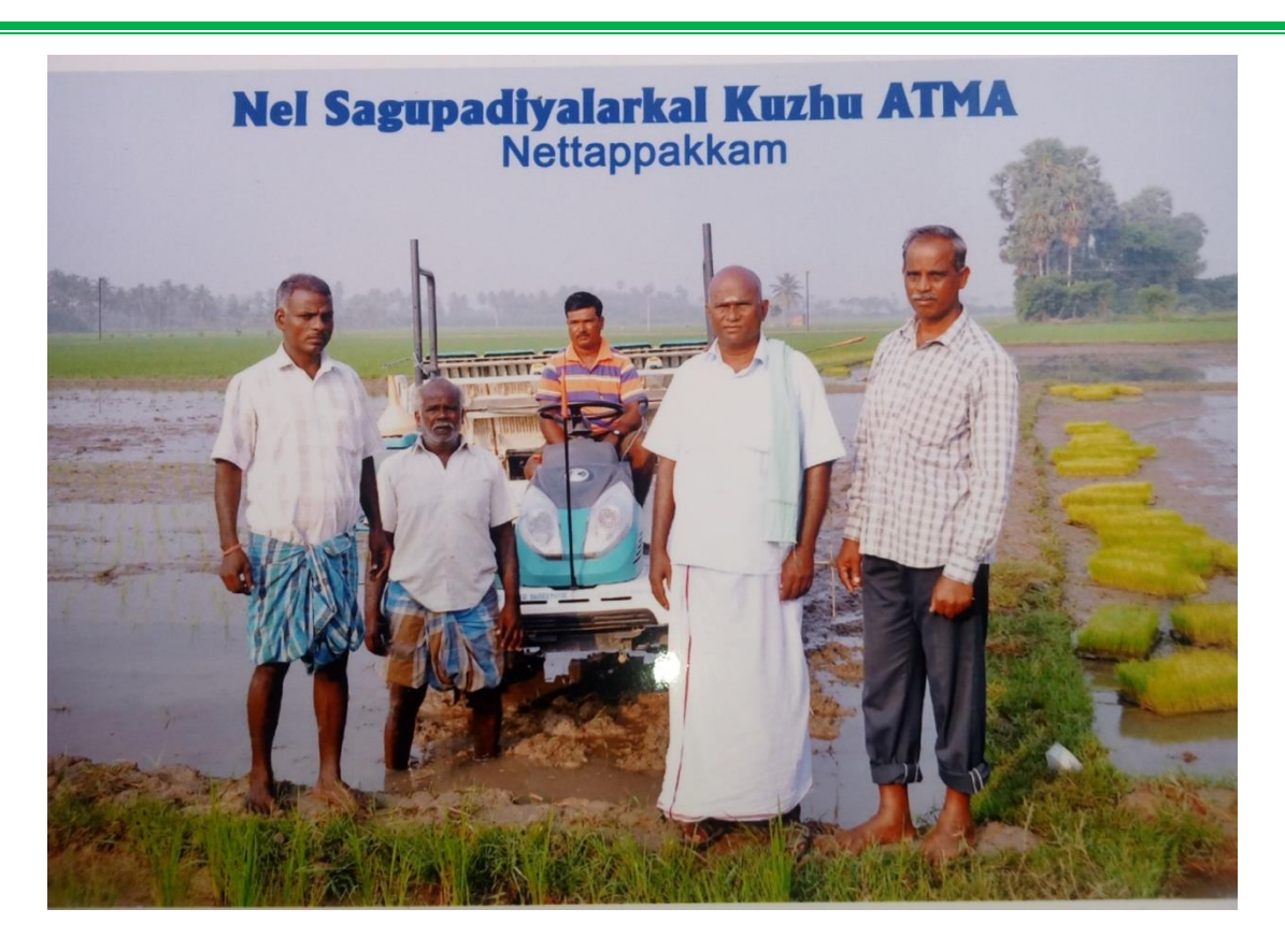
CIG PRESIDENT AND MEMBERS WITH PADDY TRANSPLANTER