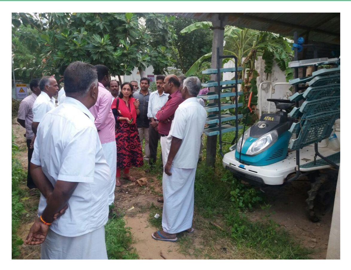
THE JOINT SECRETARY (RKVY), GOVT. OF INDIA, N. DELHI INSPECT THE CUSTOM HIRING CENTRE ESTABLISHED BY THE CIG AND INTERACT WITH CIG MEMBERS