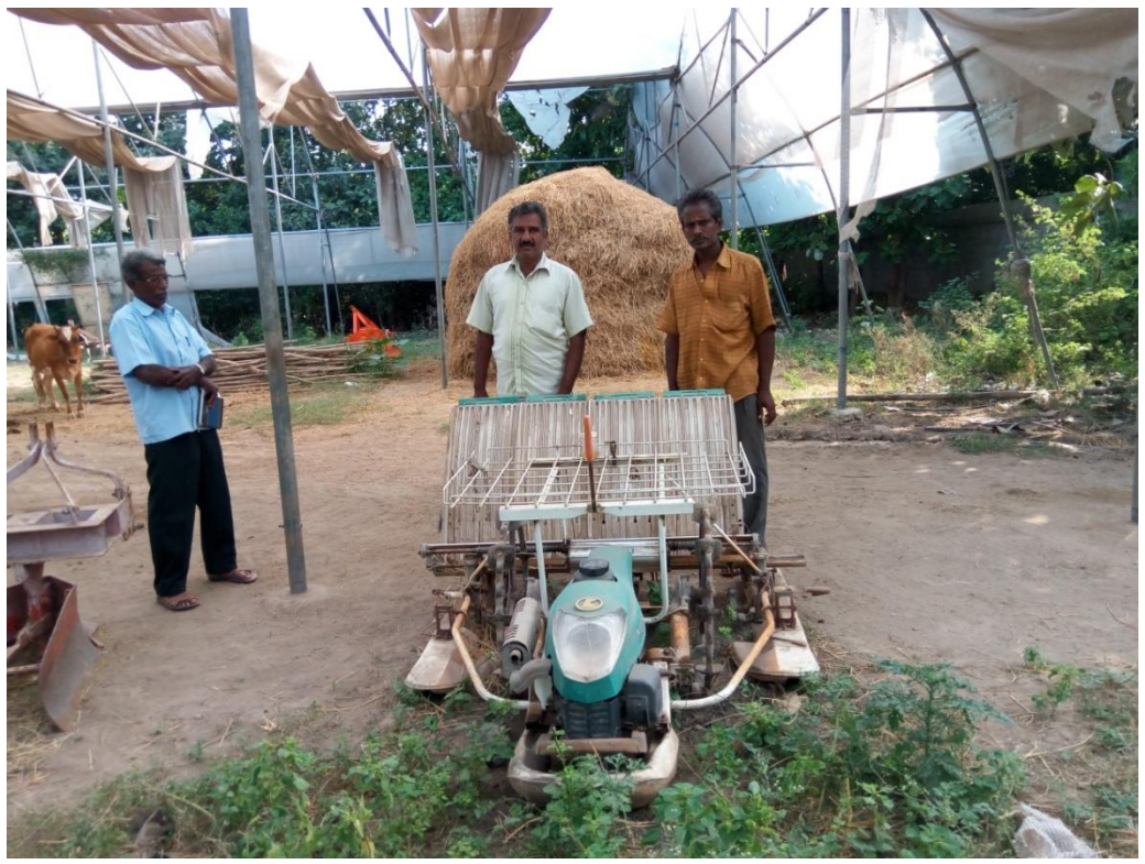
NEW TRANSPLANTER PURCHASED WITH THE PROFIT